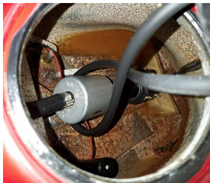
Ex: Rust in tank